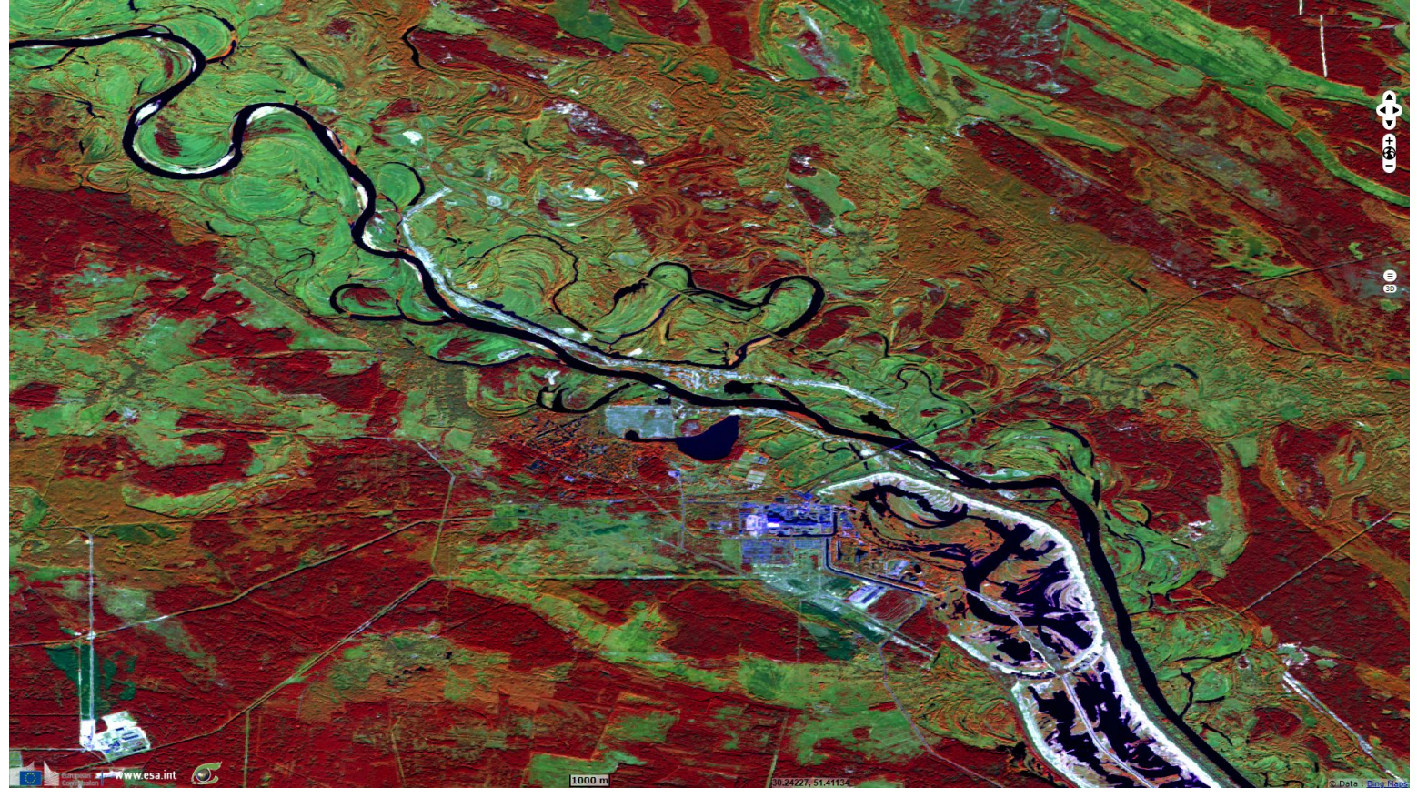
The views expressed herein can in no way be taken to reflect the official opinion of the European Space Agency or the European Union. Contains modified Copernicus Sentinel data 2019, processed by VisioTerra.