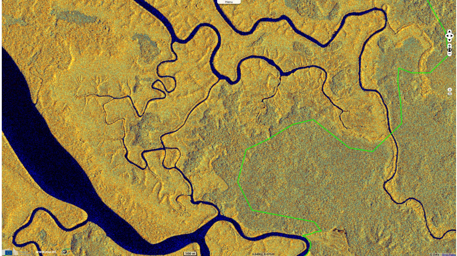
Fig. 4 - S2 (07.03.2021) - Pongara includes a wide range of mangroves and riverine, swampy, littoral & flooded forest types, grassy savannas. 2D view