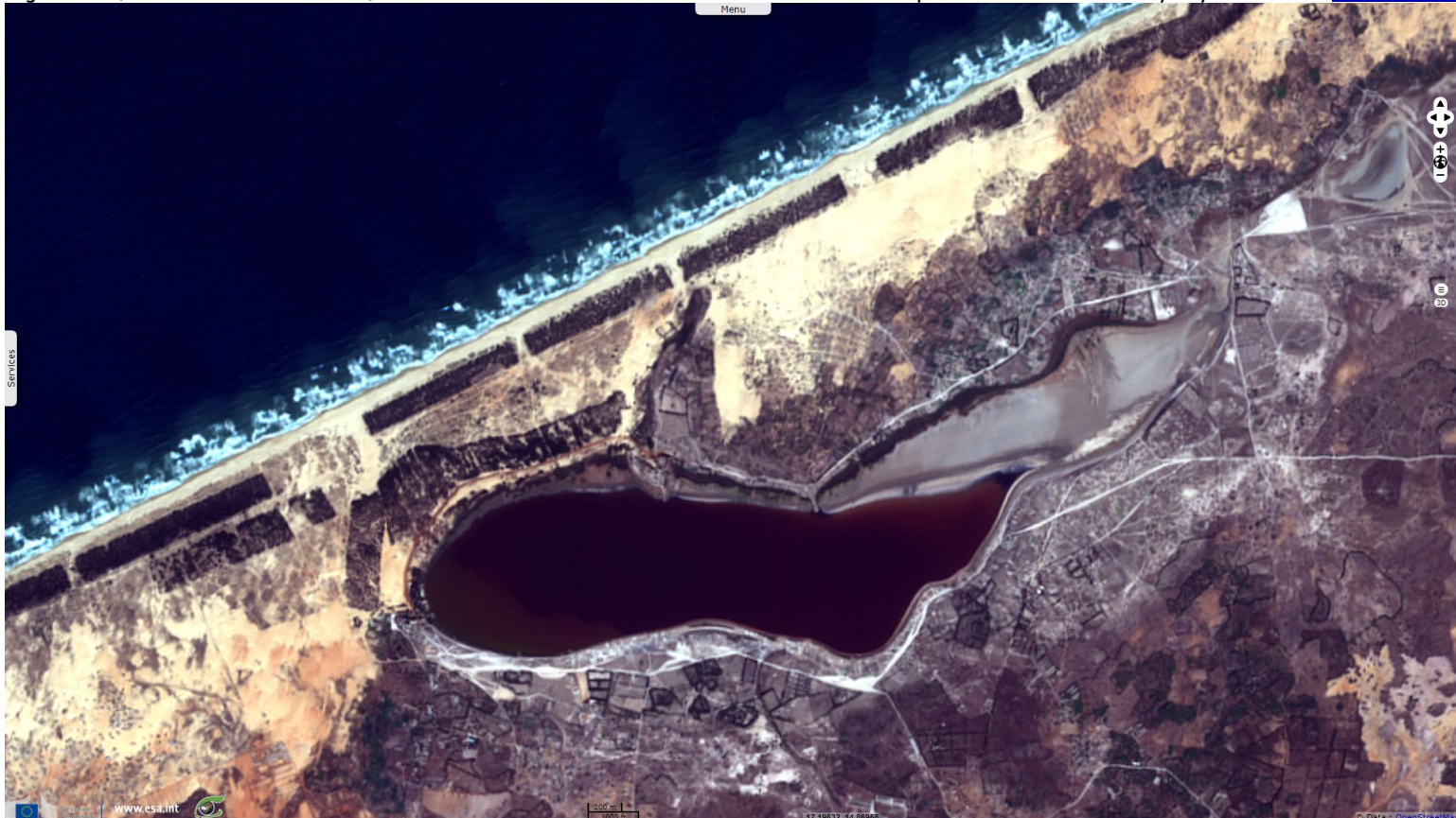
Fig. 2 - S2 (18.01.2018 & 10.10.2017) - Lac Rose or Lake Retba is a saline lake known for its pink colour on clear windy days. 2D animation

Dakar hosts 80% of Senegal economic activity. Its popn is crammed on a tiny portion of the country since Dakar shape makes it hardly extensible.