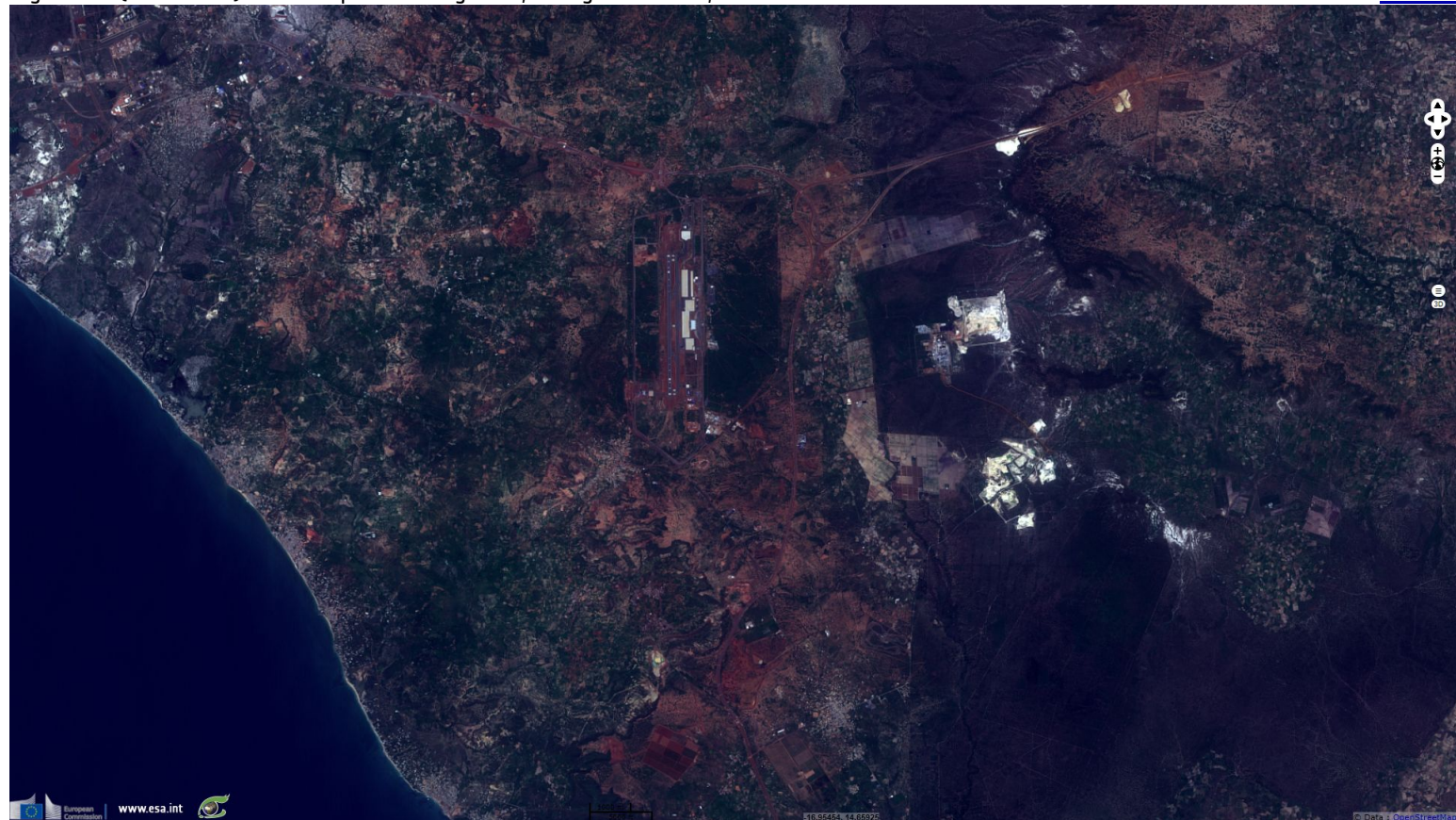
Fig. 4 - S1 (31.01.2017) - vv,vh,ndi(vh,vv) - Pointe des Almadies, westernmost land of mainland Africa, is home to an important oceanic front.