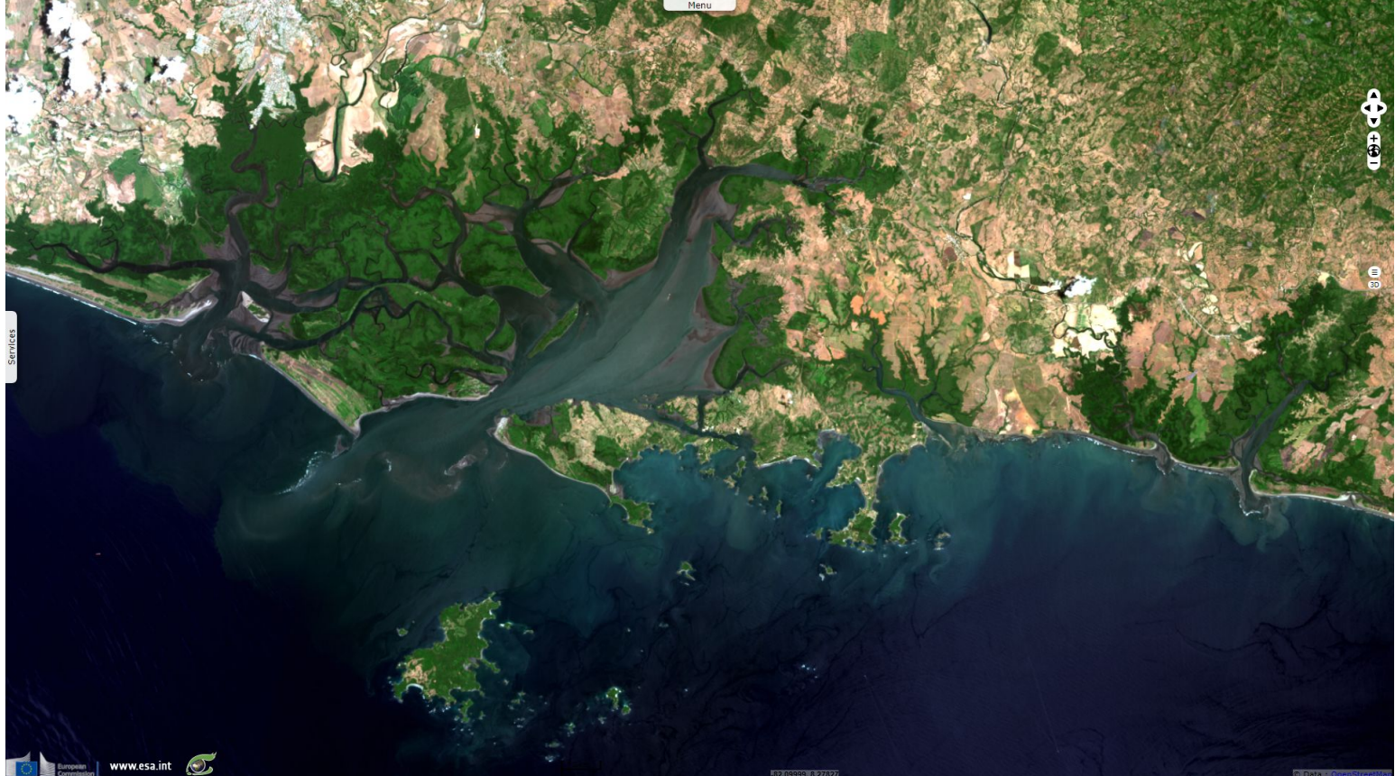
Fig. 2 - 19.01.2016 - 4,3,2 natural colour - Montijo Bay Ramsar site and the Gulf of Panama lead to the Pacific Ocean.