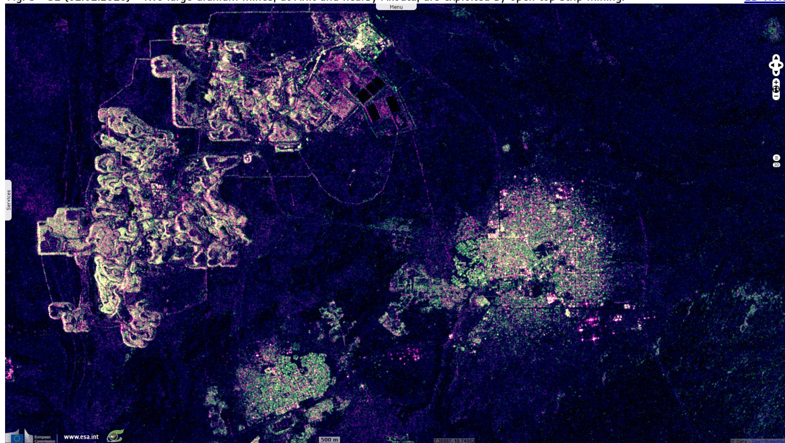
Fig. 4 - S1 (15.02.2021) - At its peak in the 1980s, uranium represented 90% of Niger's exports by value.