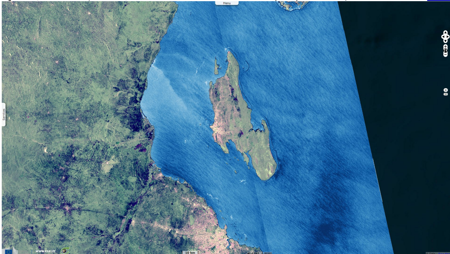
Fig. 2 - S2 (20.05.2021) - Seen by Sentinel-2, Unguja, the main island of the Zanzibar Archipelago where is located Zanzibar city.