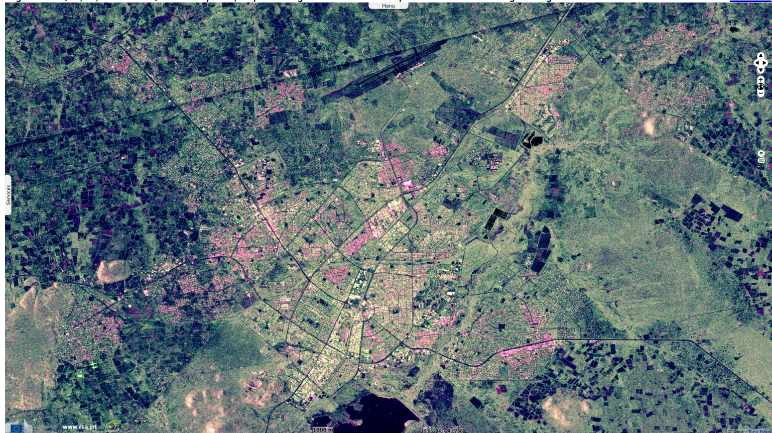
Fig. 4 - S2 (16.03.2019) - Original city planners have sometimes been pointed as the cause of Gaborone's development problems.