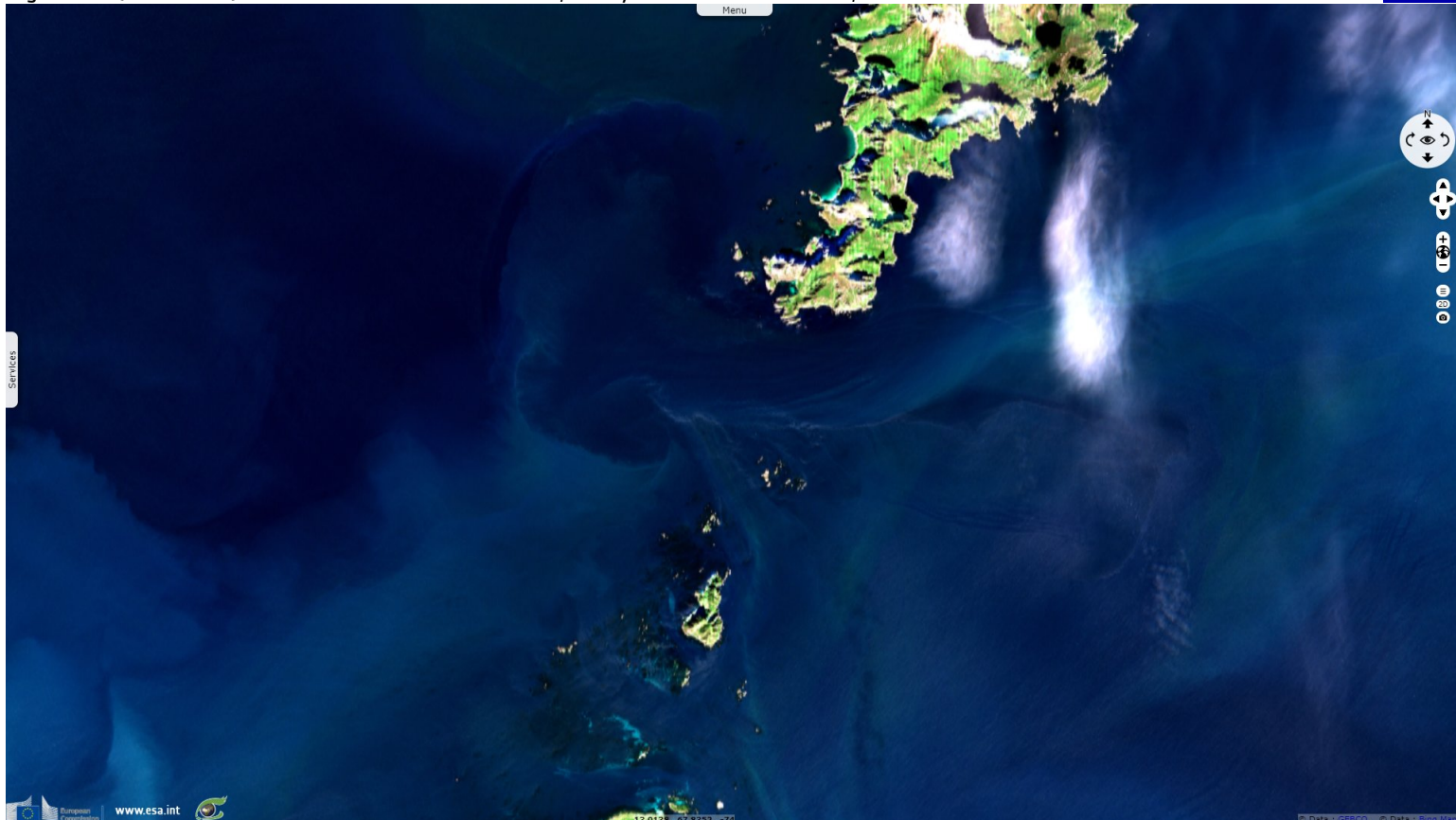
Fig. 2 - S1 (28.07.2017) - Ebb tide. It is one of the worlds strongest tidal currents in open ocean areas (> 3m/s).