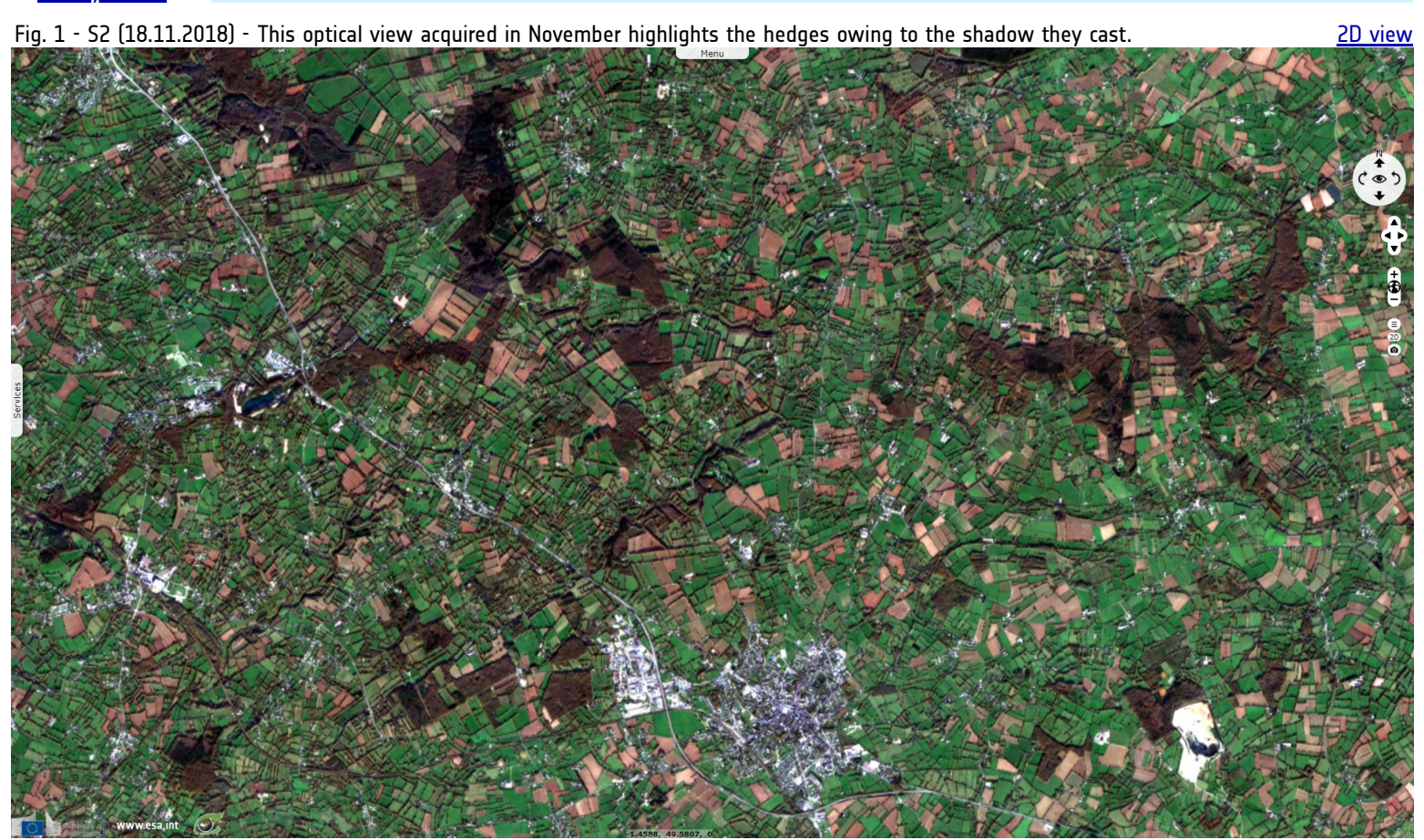
Typical landscape of Normandy, the bocage hedgerows are renown as the 1st inland combat field of the allied soldiers after the Normandy landings.