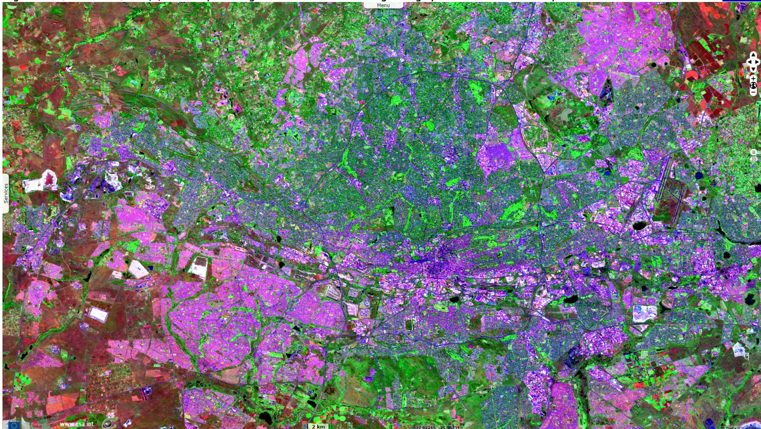
Fig. 2 - 4,3,2 natural colour - Surrounded by vegetation and large roads, standing suburbs are darker than densely packed roof plate slums.