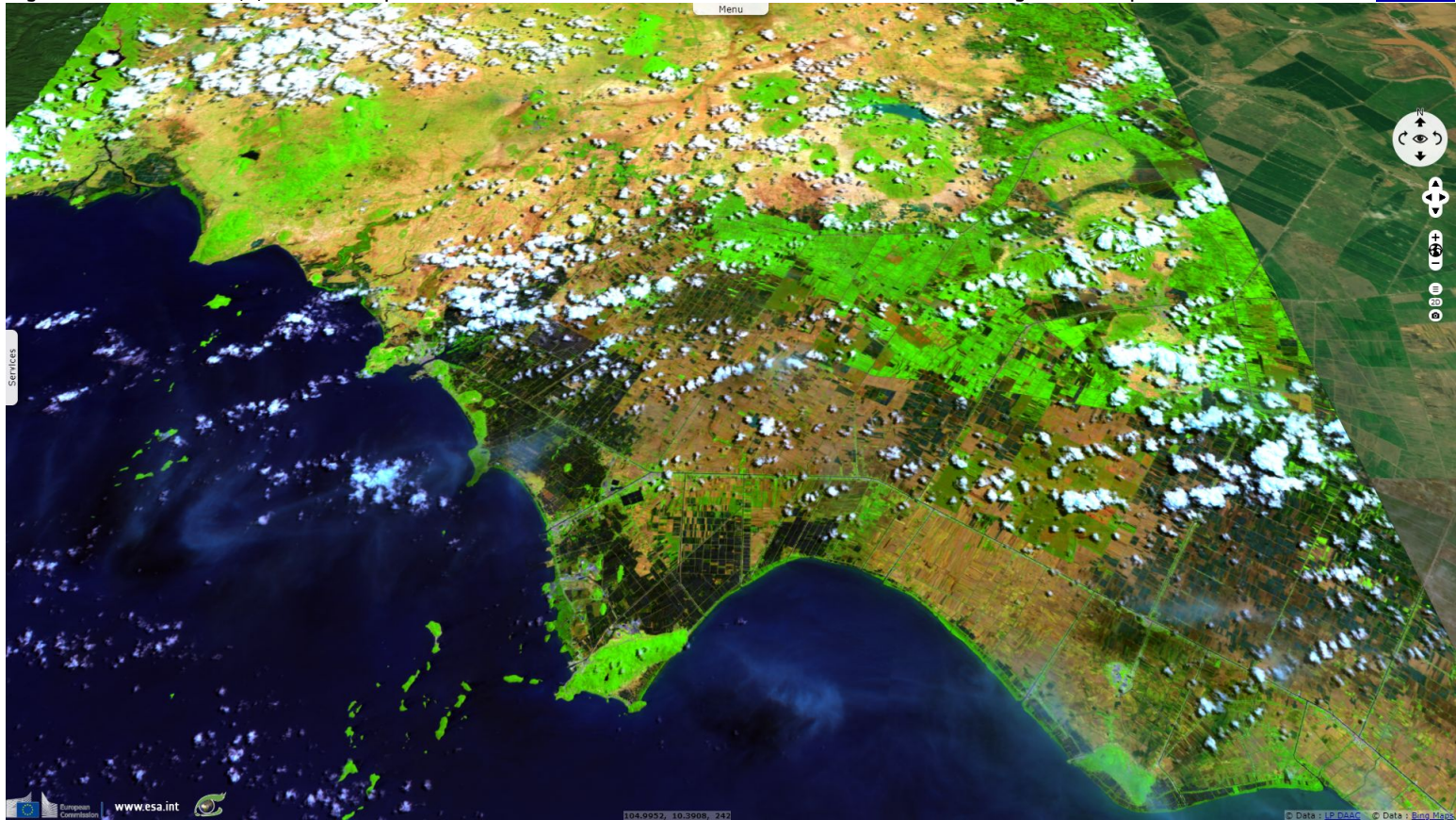
Fig. 4 - 19.09.2015 - 11,8,2 colour composite - The flat floodplains receive rich silt deposits when the monsoon flooding arrives.