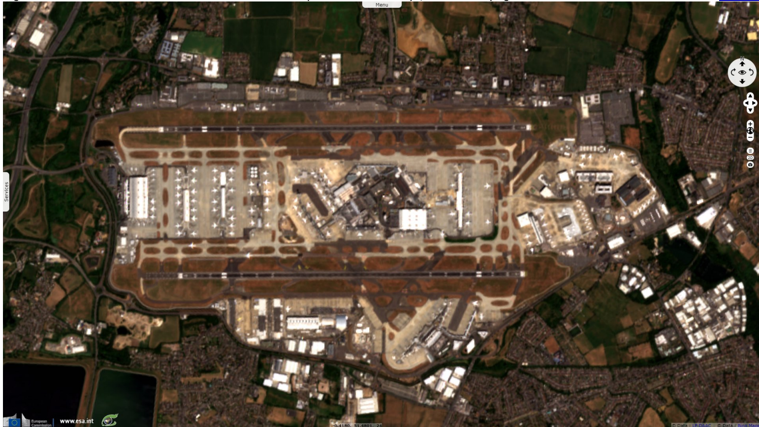
Fig. 4 - S1 (02.06.2020) - Heathrow is the busiest airport in Europe by passenger traffic with 80.8 million passengers in 2019.