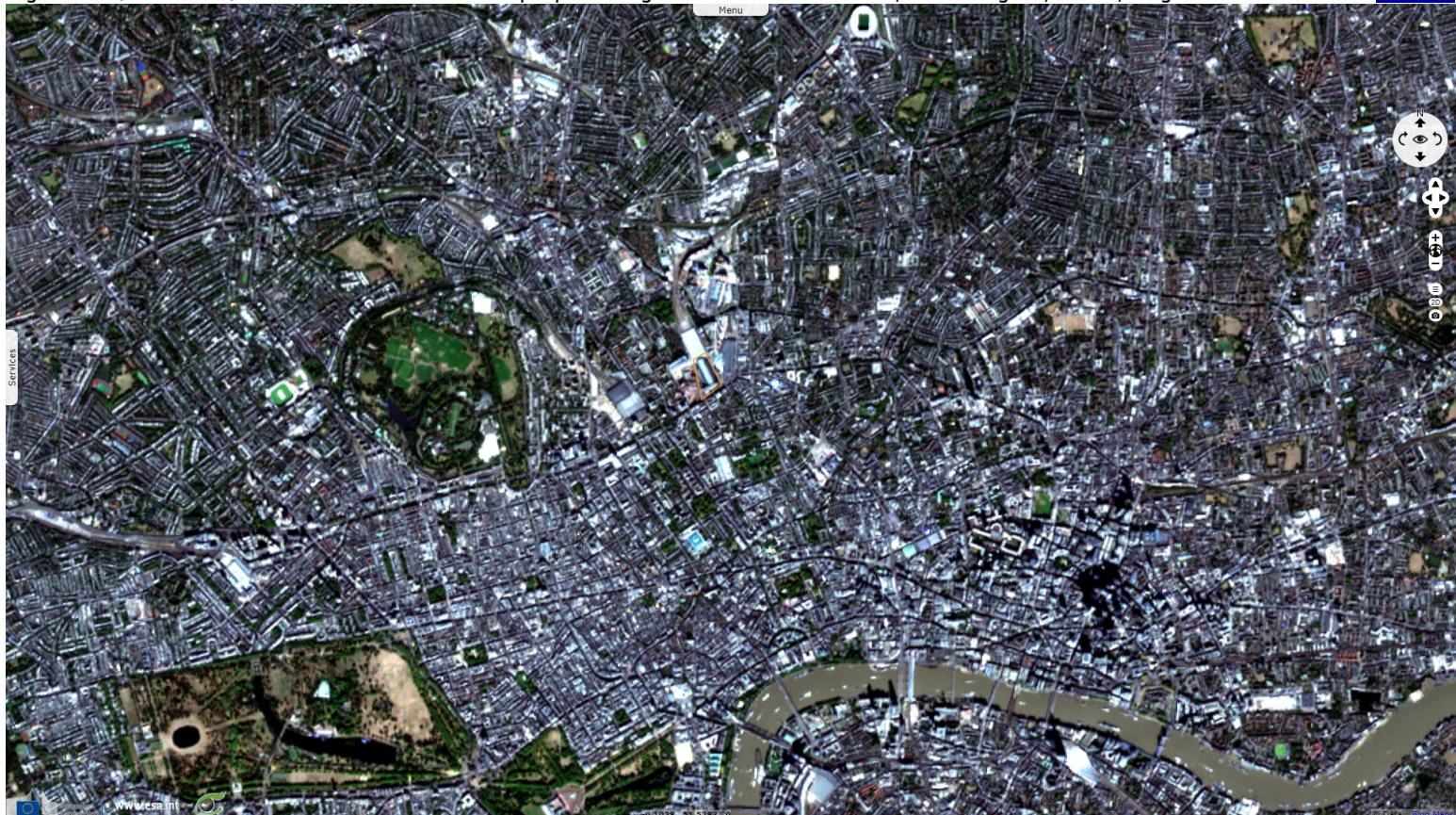
Fig. 2 - S2 (21.09.2019) - Eurostar carried 11 million people through Channel Tunnel in 2018, connecting UK, France, Belgium & Netherlands. 2D view

Anyone arriving in the UK (except from Ireland) must observe a 14-day quarantine from 8 June. This contrasts with the reopening started in the EU.