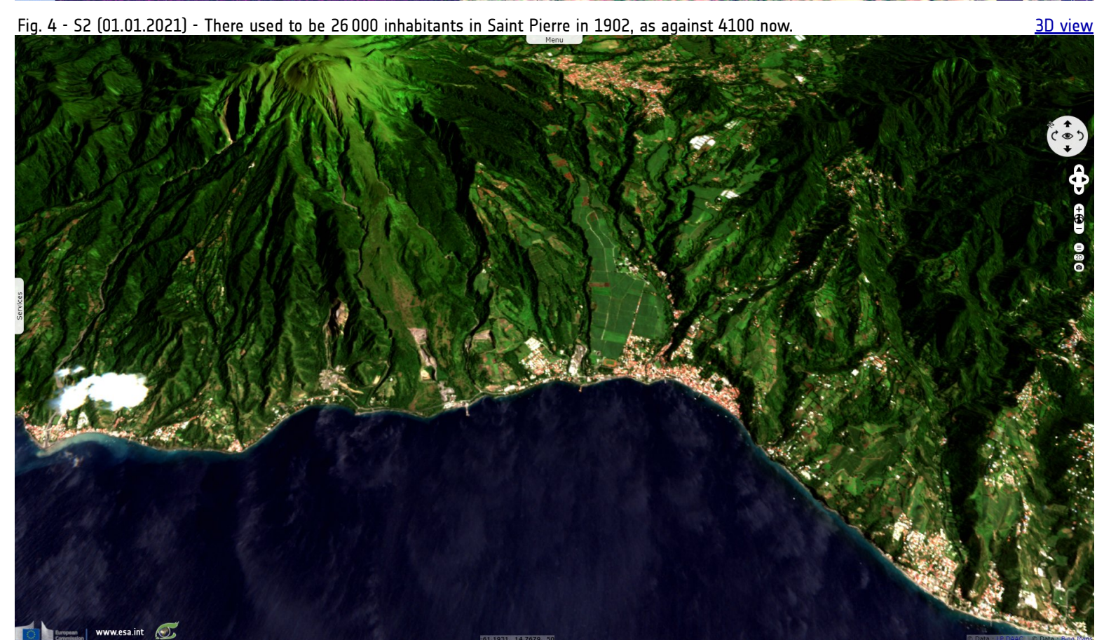
The views expressed herein can in no way be taken to reflect the official opinion of the European Space Agency or the European Union. Contains modified Copernicus Sentinel data 2021, processed by VisioTerra.

Fig. 3 - S1 (29.04.2018) - The main city of Martinique used to be Saint Pierre, south of Mount Pelee, it is now Fort de France. 3D view