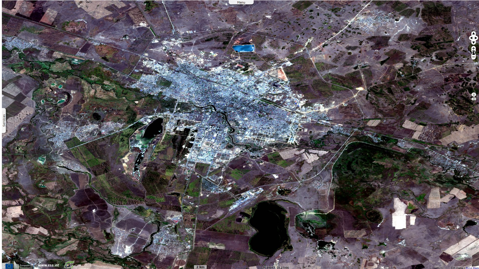
Fig. 2 - 21.11.2017 - 12,11,8 colour composite - It has become the capital in 1997 instead of Almaty, located on the border in a seismic area. 2D view