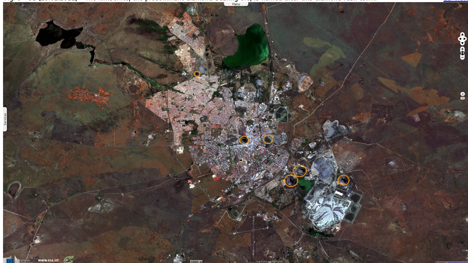
Fig. 4 - S2 (23.02.2022) - Kimberley 'Big Hole', an open-pit & underground mine, claimed to be the deepest hole excavated by hand at 240m.