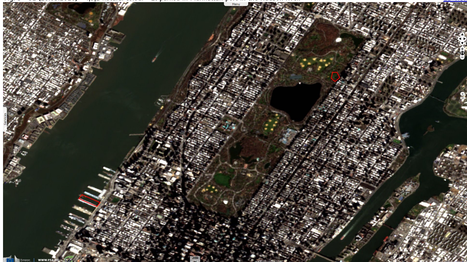
Fig. 4 - S2 (02.04.2020) - A field hospital of tents of beds has also been built in Central Park.