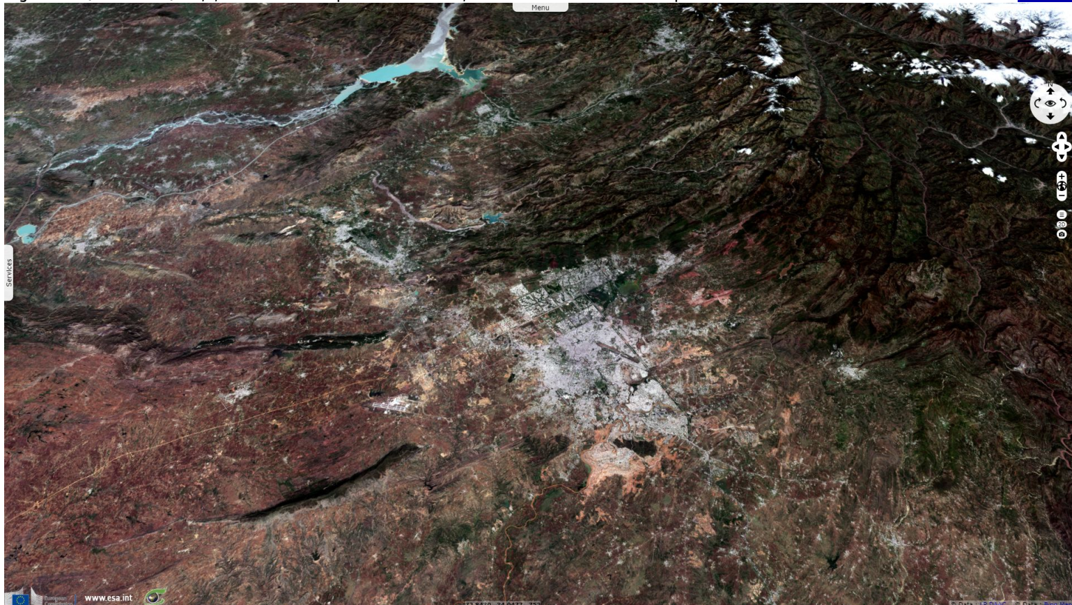
Fig. 2 - 21.05.2018 - To this end, Islamabad was built around Rawalpindi (next to Himalayan foothills & near the Indian border) from 1961.